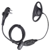
EHM15-A D-Style Earloop

External earpieces with in-line PTT Mics and VOX (hands free) switch