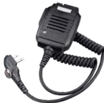
SM13M1 ① Noise Cancelling with High / Low Speaker Volume IP55 Rated, 3.5mm audio jack