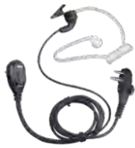
EAM12 Transparent Acoustic Tube Earpiece