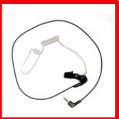
Receive-Only Earpiece with Transparent Acoustic Tube (for use with remote speaker microphone) ESS08