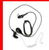
Earpiece with on-MIC PTT & Transparent Acoustic Tube EAN12