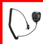
Remote Speaker Microphone SM08M3