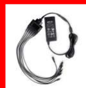
Six-unit Switching Power PS7002