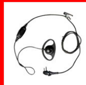
D-earset with in-Line MIC & VOX EHM15