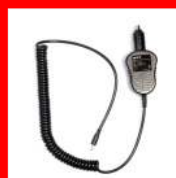
Vehicle Power Adapter CHV09