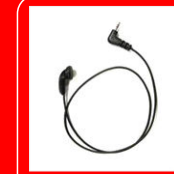
Receive-Only Earpiece (for use with remote speaker microphone) ESS07

Note: Pictures above are for reference only and may vary from actual product.