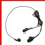
Earbud with on-MIC PTT & VOX ESM12