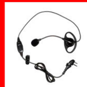
D-earset with Boom MIC & VOX EHM16