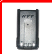
Li-Ion Battery (1300mAh) BL1301