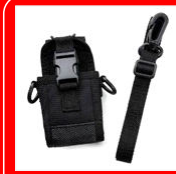
Nylon Carrying Case (not swivel)(black) NCN001