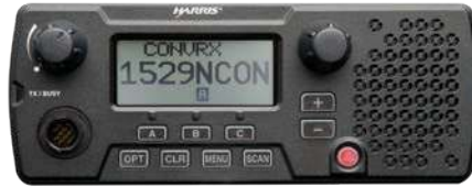
CH-25 Control Unit

The XG-25M comes standard with a CH-25 front-mount control unit. A conversion kit is available for remote mounting. The control unit is a Scan (limited keypad) model with a 4-line, 12-character alphanumeric display. The unit supports P25, 800 MHz EDACS and ProVoice, and OpenSky trunking operation.